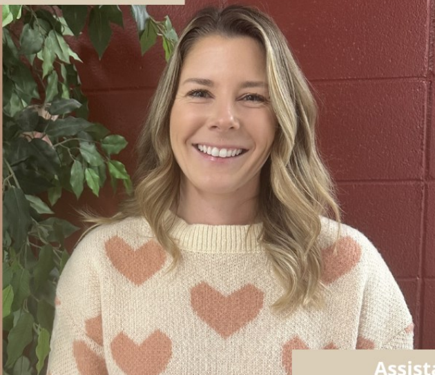
Assistant Principal St. Paul Regional High School