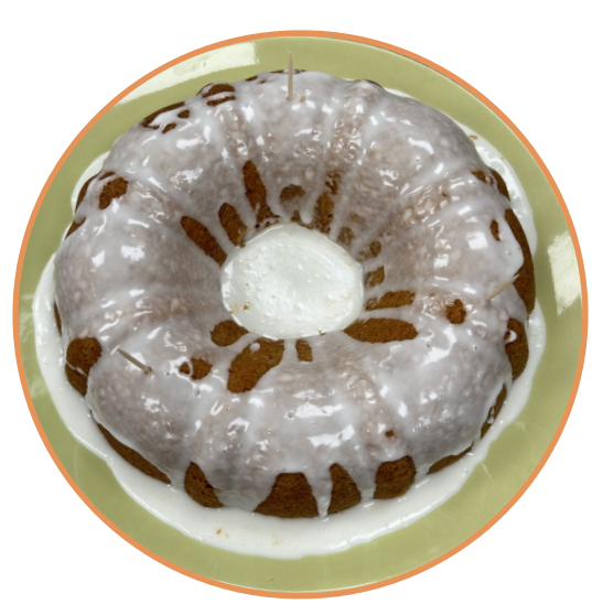
Above: Tasty creations from the Foods Room.